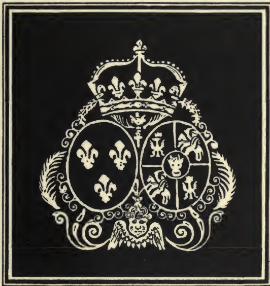
MARIE LECZINSKA, WIFE OF LOUIS XV.